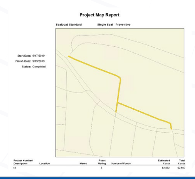
The Project Map report show projects on maps as well as providing information

Hopefully these new features will make finding roads to select in the Project Builder and Routine Maintenance windows even faster and easier than before, saving users time and making it more economical to create and compare different plans.