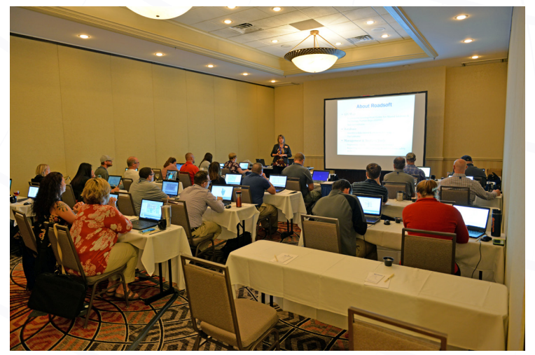
An Introduction to Roadsoft training session was held the day before the RUCUS at the same venue.

or suggestions for future software enhancements. The event also provided attendees with networking opportunities with other agencies.