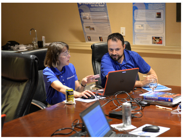
RUCUS provides opportunities for attendees to work one-on-one with Roadsoft developers in the Roadsoft Lab.

Sharing knowledge is at the heart of our mission at the CTT. With that mission in mind, a variety of Roadsoft topics and presenters were selected to provide an array of perspectives and experiences from both customers and CTT developers. Conference topics included roadway asset inventory, inspection, and maintenance; using the Roadsoft Culvert, Drainage Structure, and Sidewalk Modules; safety, pavement management strategies, and project planning.